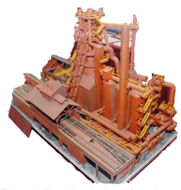
This steel mill model received a lot of attention - and votes - from judges and attendees alike.