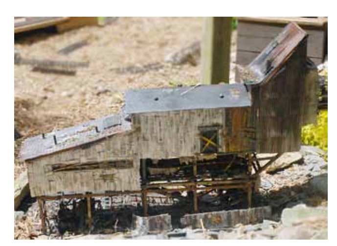
A G scale mine located on a garden layout during Sunday's open houses.